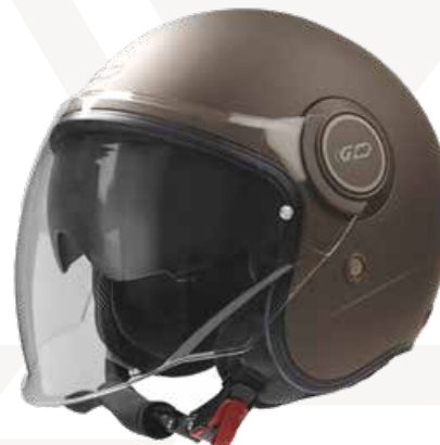
Matt Black GH9069 MT-CFF