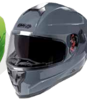
Glossy Nardo Grey GH9008 GRY