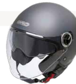
Matt Titanium Grey GH9006 MT-TTN-GRY