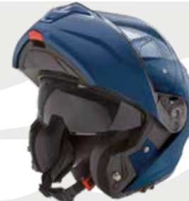
Matt Blue GH9005 MT-BLU