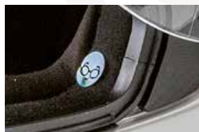
Easy Fit Glasses