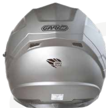
Rear air vents