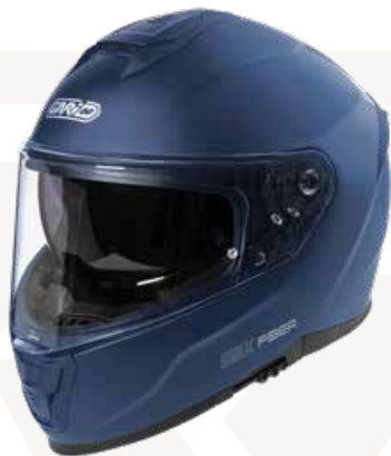
Matt Blue GH9035 MT-BLU