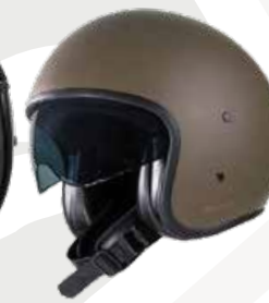
Matt Coffee GH9002 MT-CFF