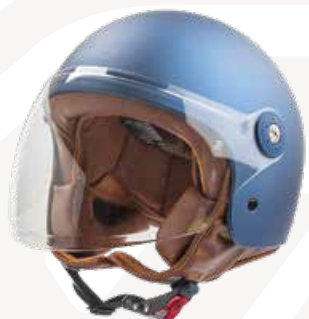
Matt Blue GH9071 MT-BLU