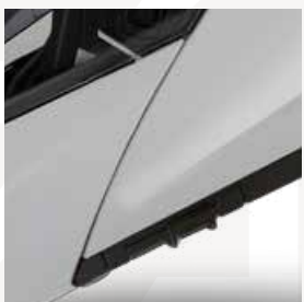
Opening SunVisor device