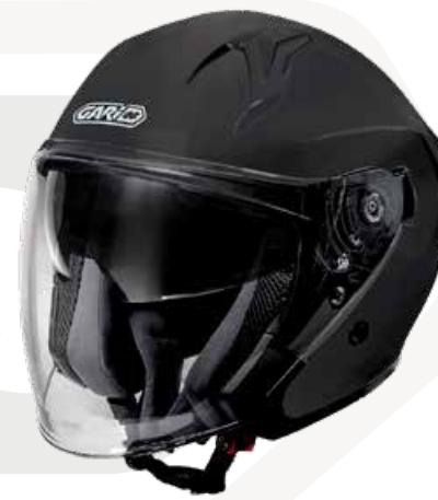
Matt Black GH9038 MT-BLC