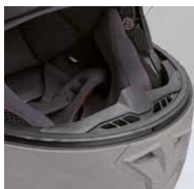
Breath deflector and front air inlet