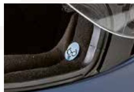
Easy Fit Glasses