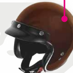
Glossy Copper Brown GH9001 CPP-BRW