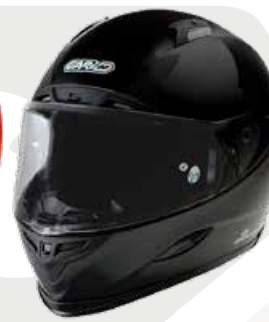
Glossy Black GH9010 BLC