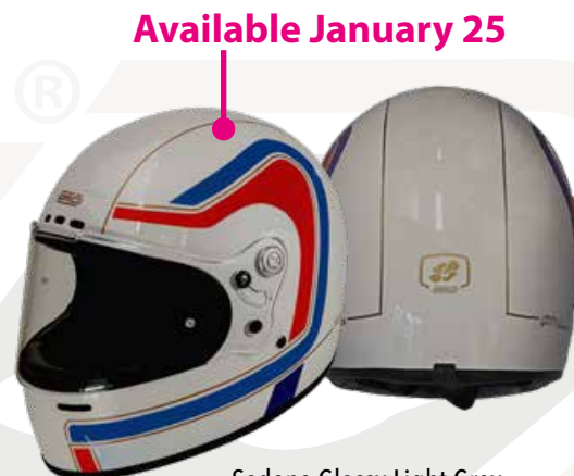
Sedona Glossy Light Grey GH9054 LG-GRY