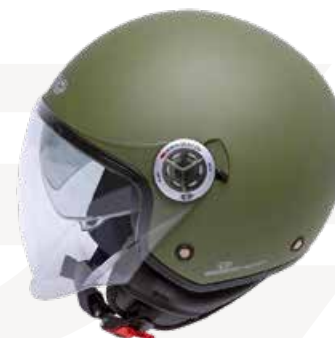
Matt Military Green GH9006 MT-ML-GRN

2 possible configurations: only with sunvisor (on / off) and with sunvisor + screen