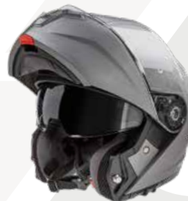
Matt Titanium Grey GH9005 MT-TTN-GRY