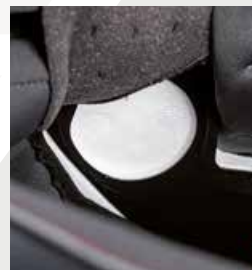
Inner pocket for Speakers

Removable and washable interior made of breathable and anti-humidity fabric