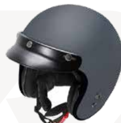
Matt Coal Grey GH9001 MT-GRY