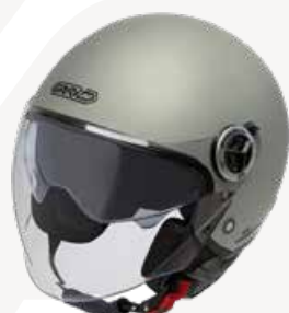
Matt Champagne GH9006 MT- PAL-GLD