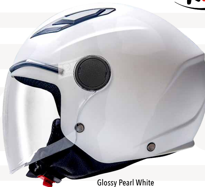
Glossy Pearl White GH9000 PRL-WHT