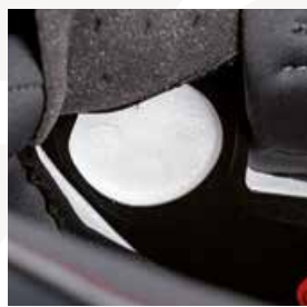
Inner pocket for Speakers