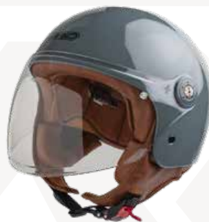
Glossy Nardo Grey GH9071 GRY