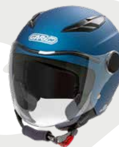
Matt Blue GH9000 MT-BLU