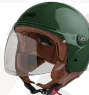
Glossy British Green GH9071 BRT-GRN