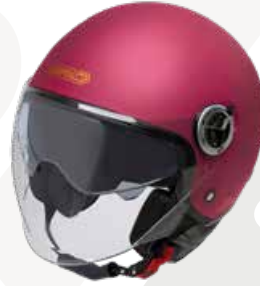
Matt Fuchsia GH9006 MT-FCH