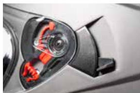
Opening SunVisor device