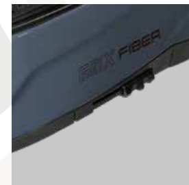
Opening SunVisor device