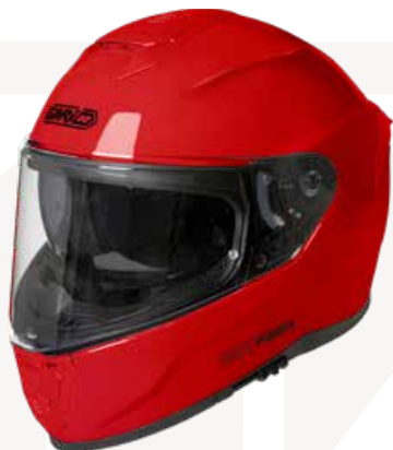
Glossy Corsa Red GH9035 RED

Sizes: XS to XXL 2 outer shell sizes: XS-M / L- XXL Fiberglass