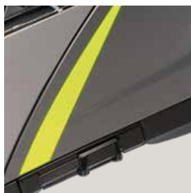
Opening SunVisor device