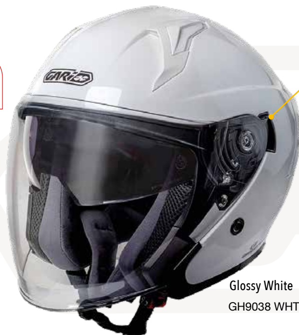
Glossy White GH9038 WHT