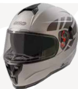
Matt Silver GH9007 MT-SLV