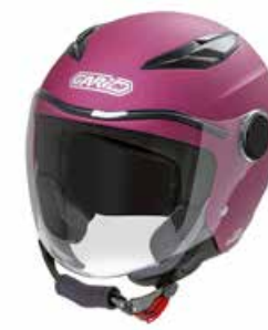
Matt Fuchsia GH9000 MT-FCH