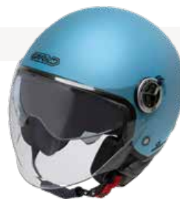
Matt Caribbean Blue GH9006 MT-CRB-BLU