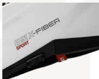
Opening SunVisor device