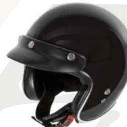
Glossy Black GH9001 BLC