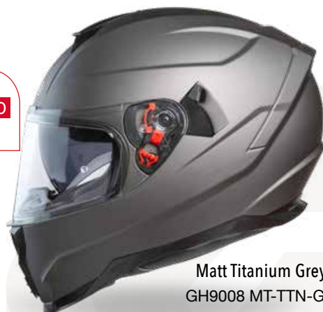
Matt Titanium Grey GH9008 MT-TTN-GRY