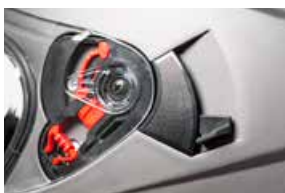
Opening SunVisor device