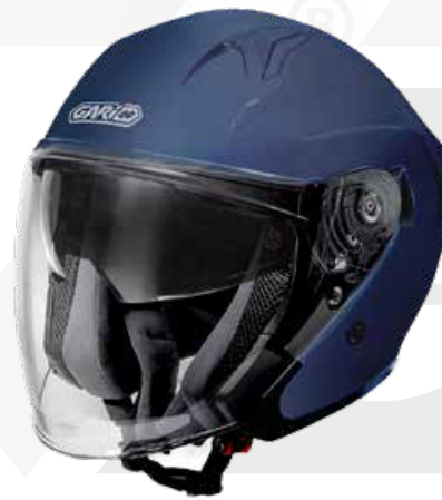
Matt Blue GH9038 MT-BLU