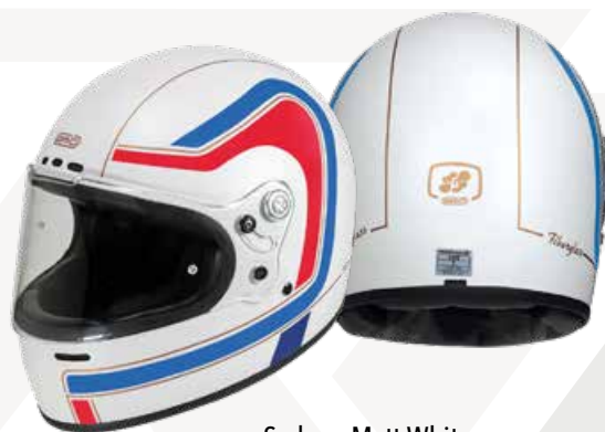
Sedona Matt White GH9054 MT-WHT