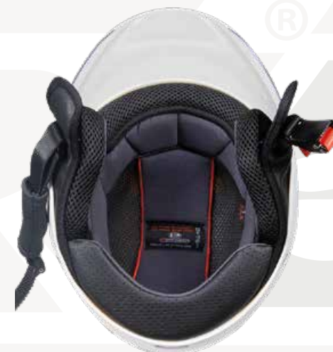
Fully removable and washable interior