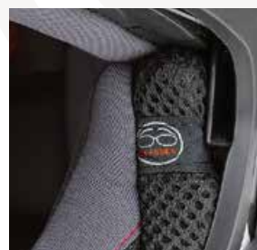
Easy Fit Glasses