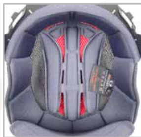
Fully removable and washable interior