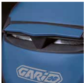
Rear air vents

Sizes: XS to XL 2 outer shell sizes: XS-L / XL XXL Lining available Fiberglass