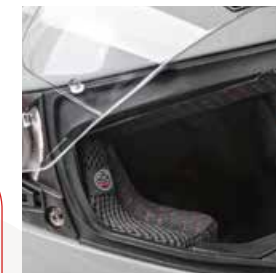
Easy Fit Glasses