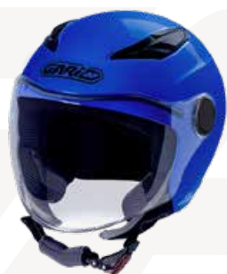
Glossy Cobalt Blue GH9000 CBL-BLU