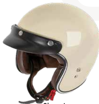
Glossy Ivory GH9001 IVR