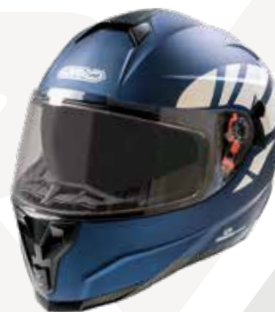
Matt Blue GH9007 MT-BLU