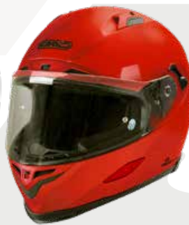
Glossy Corsa Red GH9010 RED