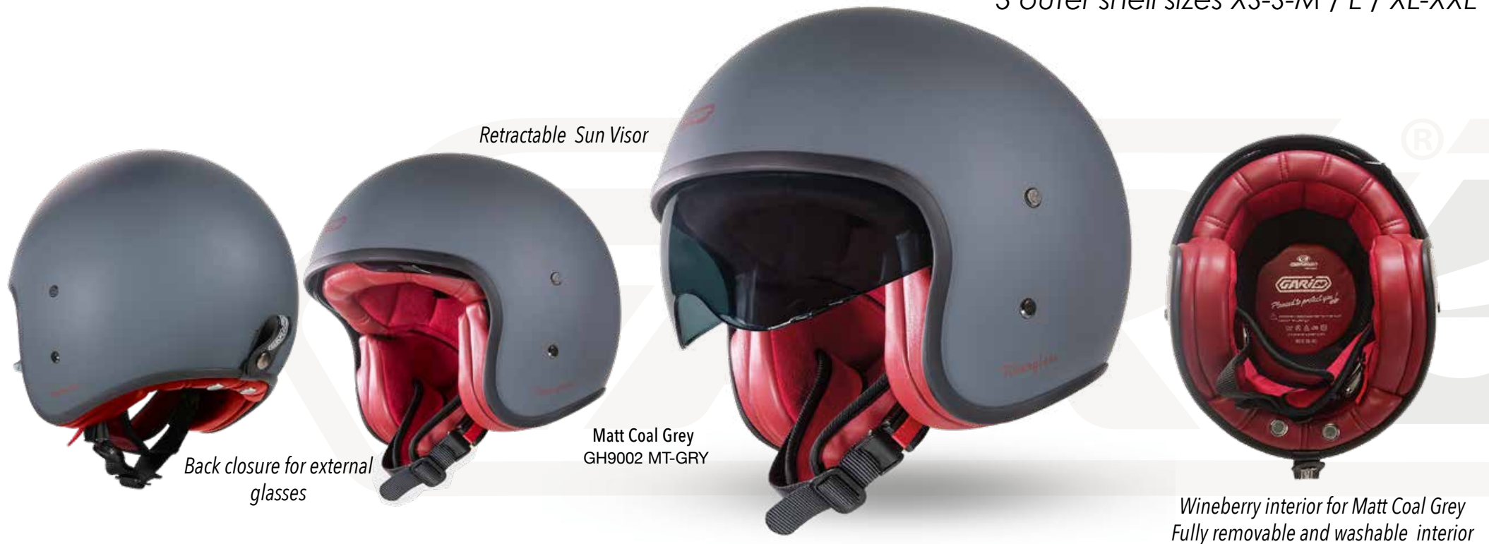
Retractable Sun Visor