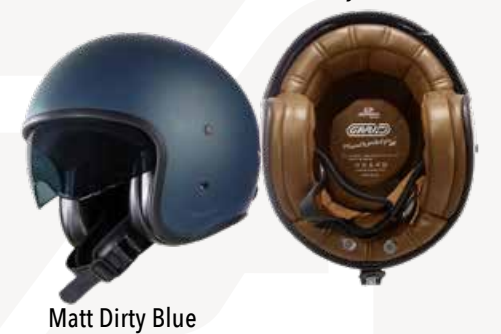
Matt Dirty Blue GH9002 MT-DRT-BLU