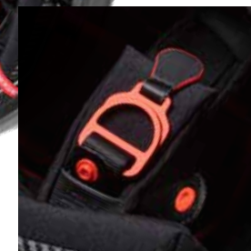
Double D Fastener