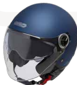
Matt Blue GH9006 MT-BLU