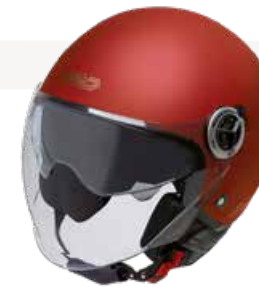
Matt Oxid Red GH9006 MT-OXD-RED