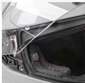
Easy Fit Glasses