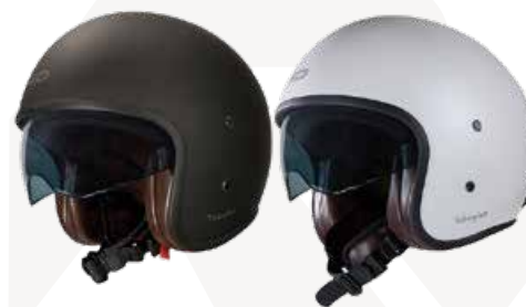
Matt Black GH9002 MT-BLC