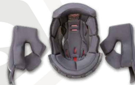
Fully removable and washable interior