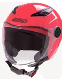
Glossy Coral Red GH9000 CRL-RED