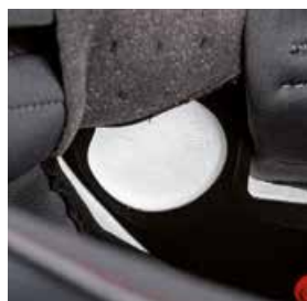
Inner pocket for Speakers