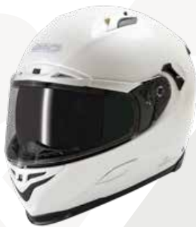
Glossy Pearl White GH9010 PRL-WHT