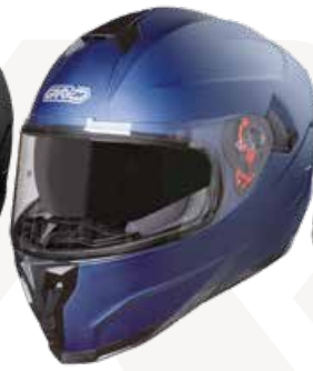
Matt Blue GH9008 MT-BLU