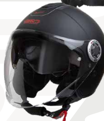
Matt Black GH9070 MT-BLC