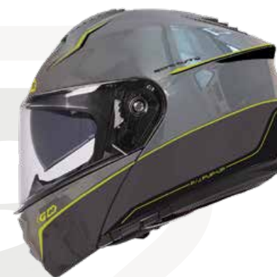
Glossy Grey GH6599 GRY-FL