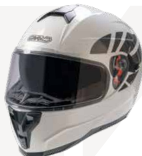
Glossy Pearl White GH9007 MT-WHT