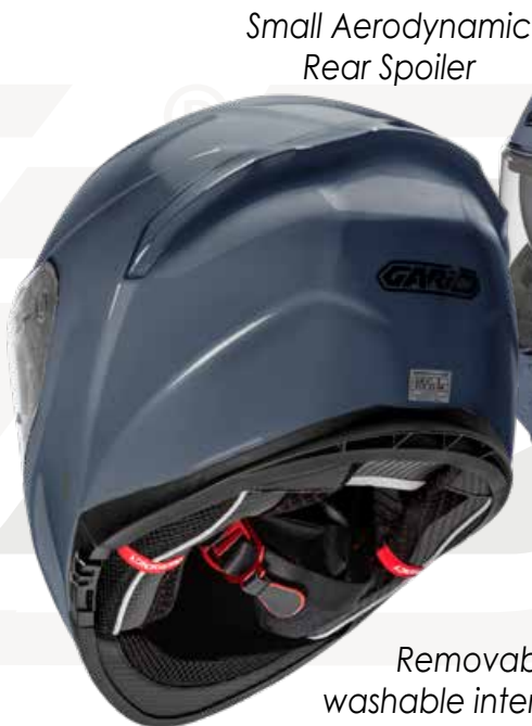
Small Aerodynamic Rear Spoiler