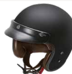
Matt Black GH9001 MT-BLC