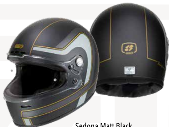
Sedona Matt Black GH9054 MT-BLC