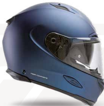
Matt Blue GH9010 MT-BLU