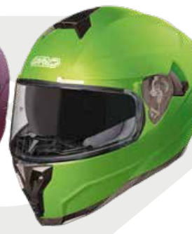
Matt Lime Green GH9008 LMN-GRN