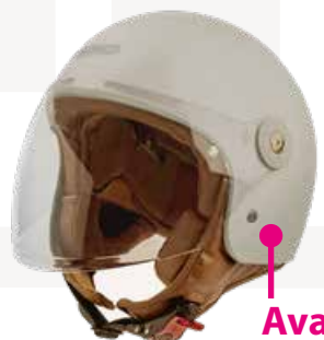
Matt Sand GH9071 MT-SND