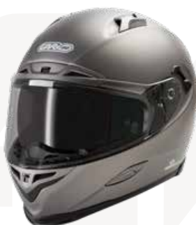
Matt Titanium Grey GH9010 MT-TTN-GRY