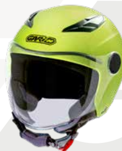
Matt Fluor GH9000 MT-FL