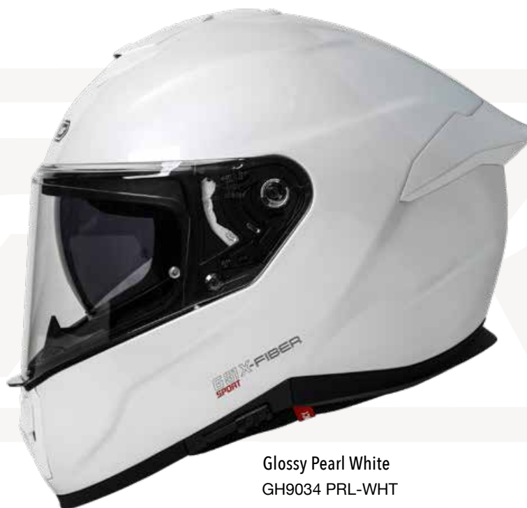
Glossy Pearl White GH9034 PRL-WHT