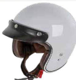
Glossy Light Grey GH9001 MT-LG-GRY