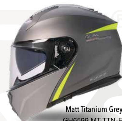
Matt Titanium Grey GH6599 MT-TTN-FL