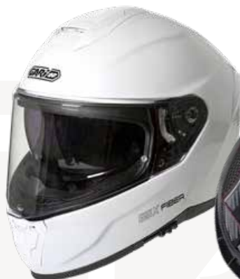
Glossy White GH9035 WHT