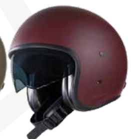
Matt Deep Oxid Red GH9002 MT-OXD-RED