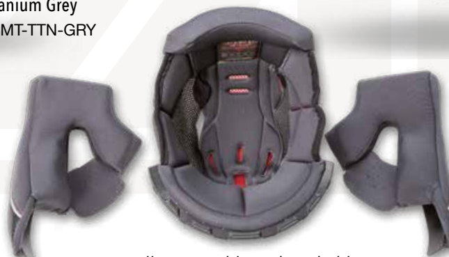
Fully removable and washable interior