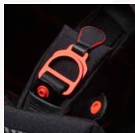
Double D Fastener