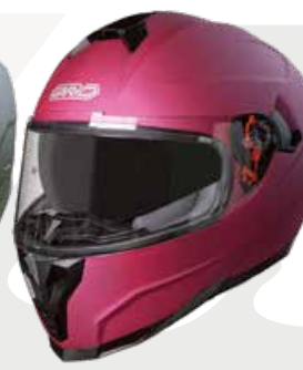
Matt Fuchsia GH9008 MT-FCH