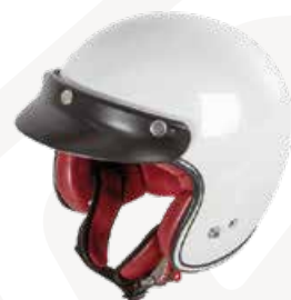
Glossy Pearl White GH9001 PRL-WHT