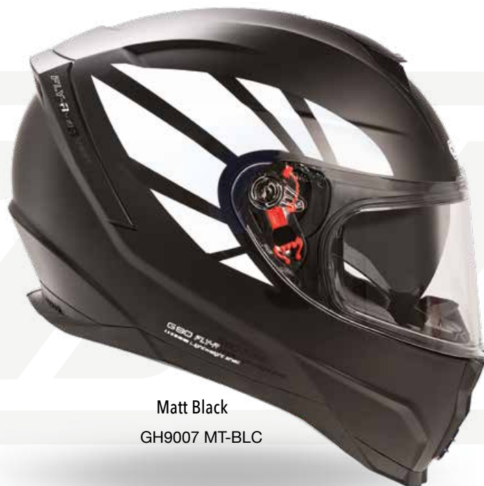
Matt Black GH9007 MT-BLC