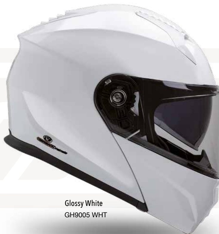
Glossy White GH9005 WHT