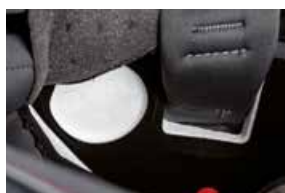
Inner space for Speakers