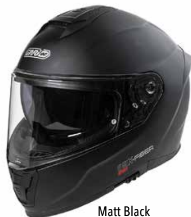
Matt Black GH9034 MT-BLC