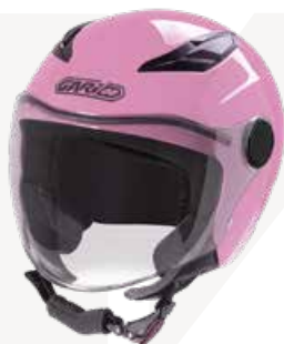
Glossy Pink GH9000 PNK