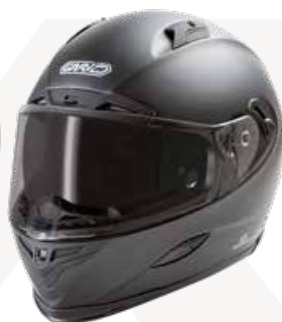
Matt Black GH9010 MT-BLC