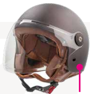
Matt Coffee GH9071 MT-CFF