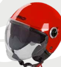
Glossy Corsa Red GH9006 RED