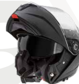
Matt Black GH9005 MT-BLC