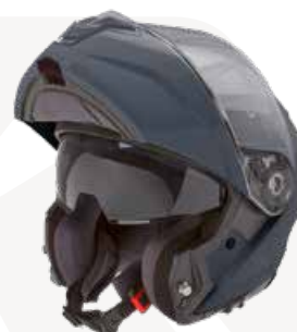
Glossy Nardo Grey GH9005 GRY