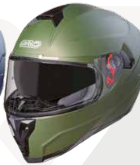
Matt Military Green GH9008 MT-ML-GRN