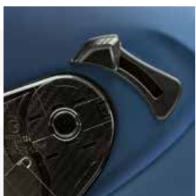
Opening SunVisor device

Removable and washable interior made of breathable and anti-humidity bamboo fabric