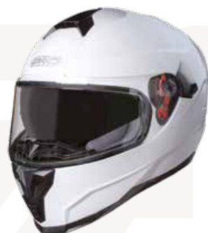
Glossy White GH9008 WHT