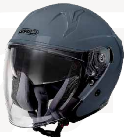
Glossy Nardo Grey GH9038 GRY