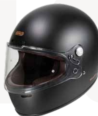
Matt Black GH9032 MT-BLC