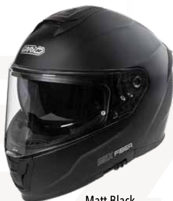
Matt Black GH9035 MT-BLC