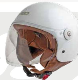
Glossy Pearl White GH9071 PRL-WHT