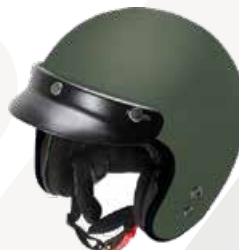
Matt Military Green GH9001 MT-ML-GRN