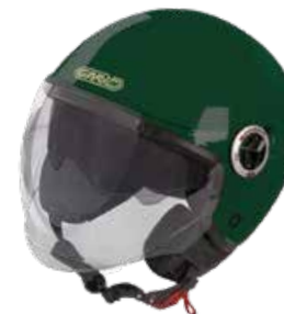
Glossy British Green GH9006 BRT-GRN