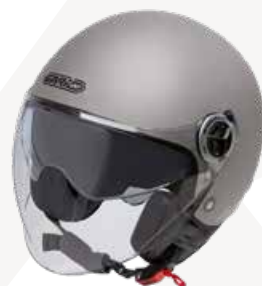
Matt Platinum GH9006 MT-SLV