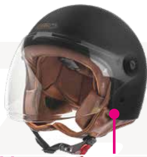
Matt Black GH9071 MT-BLC