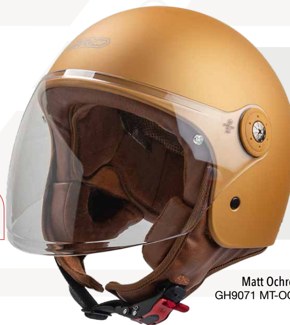
Matt Ochre GH9071 MT-OCH-YLL