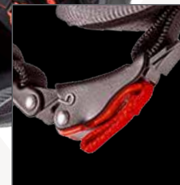
Multi-click retention system

Removable and washable interior made of breathable and anti-humidity fabric