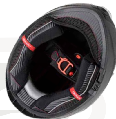
Removable and washable interior made of breathable and anti-humidity fabric