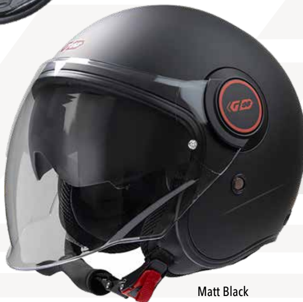
Matt Black GH9069 MT-BLC