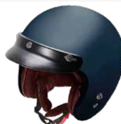
Matt Dirty Blue GH9001 MT-DRT-BLU