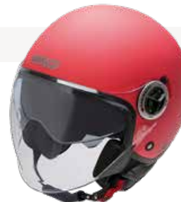
Matt Coral GH9006 MT-CLR-RED