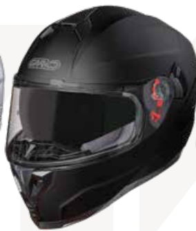
Matt Black GH9008 MT-BLC