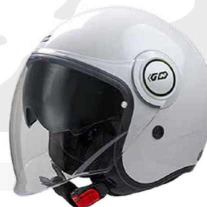
Glossy Pearl White GH9069 PRL-WHT