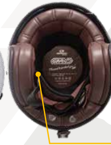
Inner space for the speakers