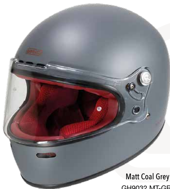
Matt Coal Grey GH9032 MT-GRY

Sizes: XS to XXL 2 outer shell sizes XS-S-M / L-XL-XXL