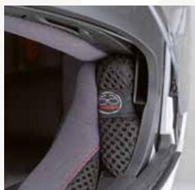
Easy Fit Glasses