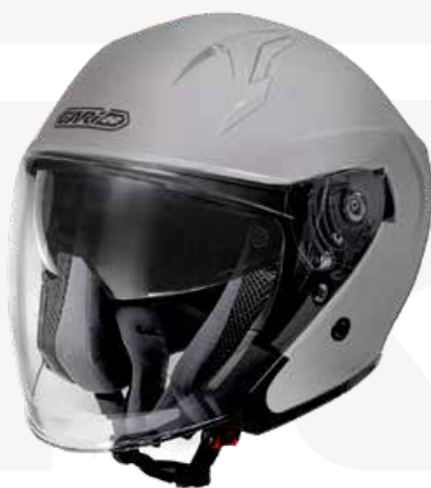
Matt Silver GH9038 MT-SLV