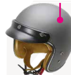
Matt Titanium Grey GH9001 MT-TTN-GRY