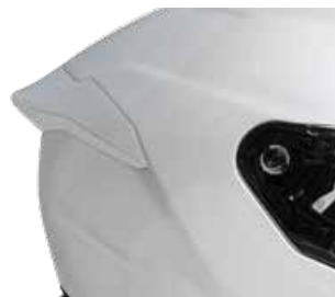
Large Aerodynamic Rear Spoiler