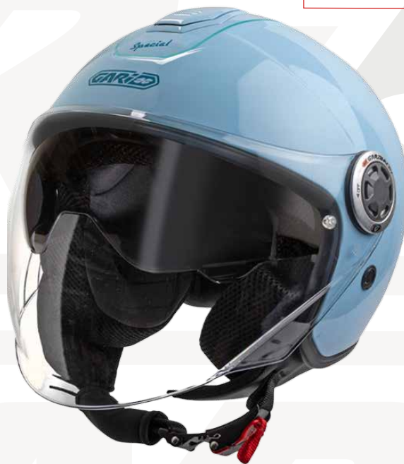
Glossy Light Blue GH9070 LG-BLU