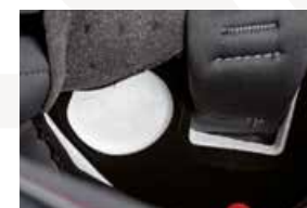
Inner space for Speakers