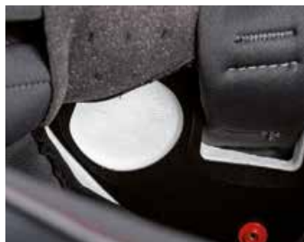
Inner pocket for Speakers

Sizes: XS to XXL 2 outer shell sizes: XS-M / L-XXL Fiberglass