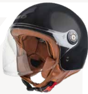
Glossy Black GH9071 BLC