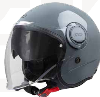
Glossy Nardo Grey GH9069 GRY