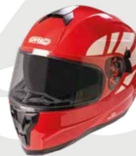
Glossy Red GH9007 RED