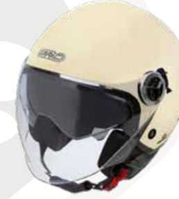
Glossy Ivory GH9006 IVR