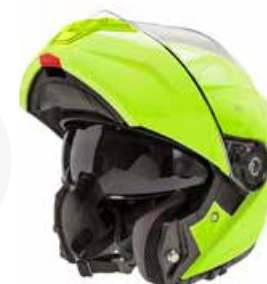
Glossy Fluor GH9005 FL