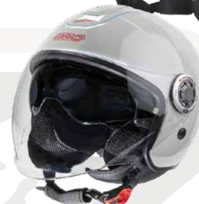
Glossy Light Grey GH9070 LG-GRY