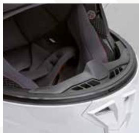
Breath deflector and front air inlet